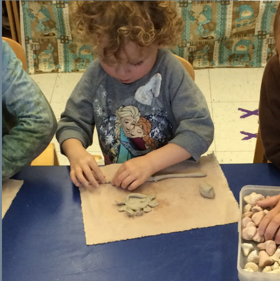
Head Start Arts program, Brattleboro Museum and Arts Center, Brattleboro