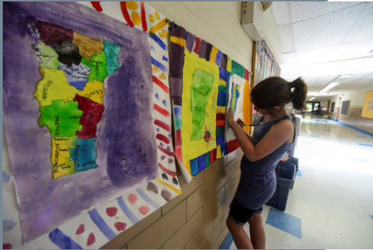
Artists in Schools program, Academy School, Brattleboro