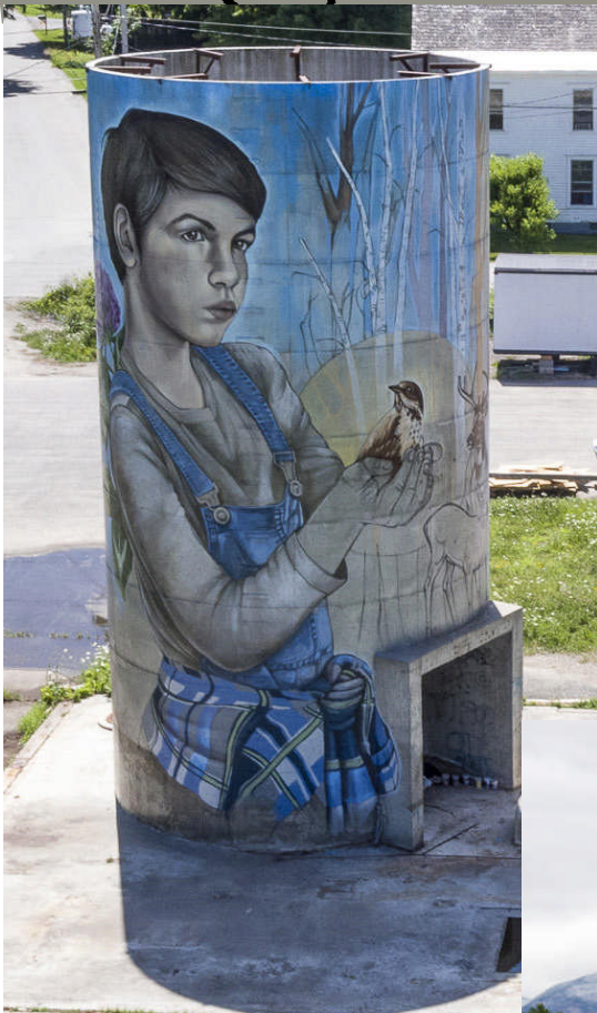
Silos Project, Cambridge, Animating Infrastructure