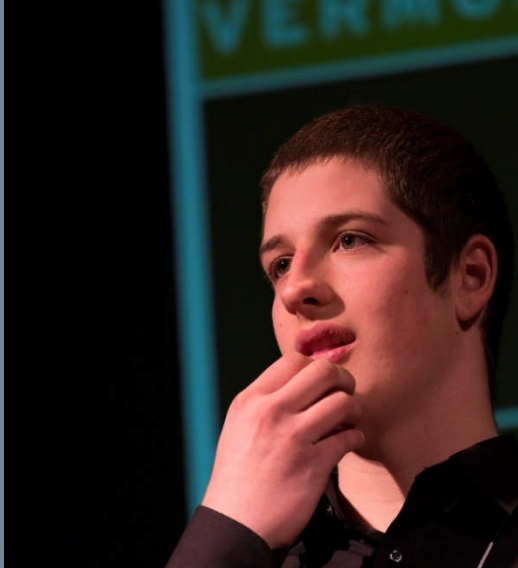
Poetry Out Loud finals, Barre Opera House Barre