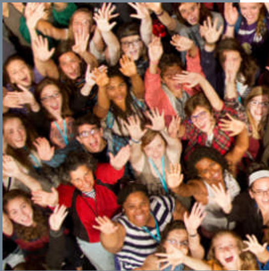
Governor's Institute, Castleton State College